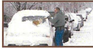
Cold Weather Is Here - Be Ready and Informed on Ordinances