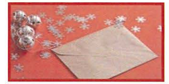
Happy New Year from Your Goodrich Village Administrator.