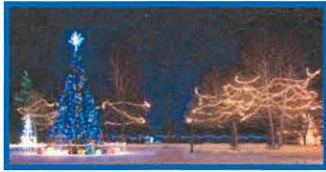
Holiday Happenings in Goodrich